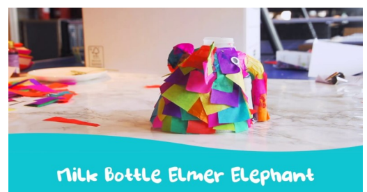
Milk Bottle Elmer Elephant